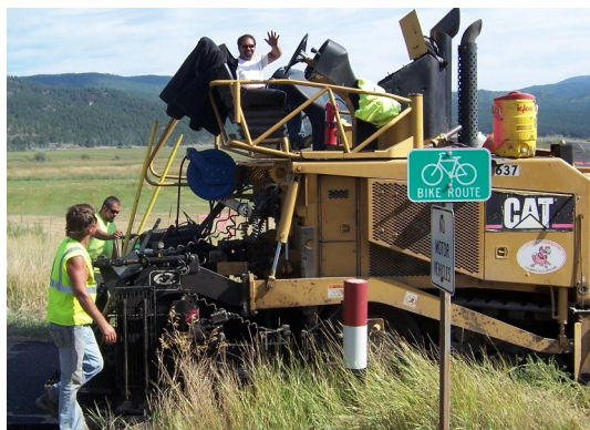
2009 Smith Valley to Kila Paving

Highway 93 reconstruction project between Somers and Kalispell that included 4 miles of paved bike path from Highway 82 north to Ashley Creek. 2001 saw the Meridian Segment Grand Opening; the placement of 14 culverts from Smith Valley School to Kila; and a gifting Catalog developed for donations. 2003 saw the Whalebone Rd to Smith Valley section completed. Also paved at this time was the isolated 1 mile section east of Dern Road. First Kalispell area trail map was published in 2004. In 2004 about 2 miles of the 3 mile Smith Valley to Kila section had sod removed and was graded; and land was donated for the trail by Audrey Kaiser and First Federal Savings and Loan. This led to the 2005 construction of 2.5 miles of trail between Dern Road to Whalebone Drive to connect the Smith Valley section with the Meridian Section. 2 more miles of the Smith Valley to Kila section was graveled. Finally in 2005, the Great Northern 5K fundraiser was started in 2005 and replaced the Kila Cruise. Successful grant writing and preparation for 2 bridges and the remaining Kila section occurred in 2006 and 2007 and in 2008 about 2 miles of the Kila segment was paved; 2 fiberglass bridges were erected over Ashley Creek along Highway 2. And finally, 2009 saw the last segment of the Kalispell to Kila trail paved.