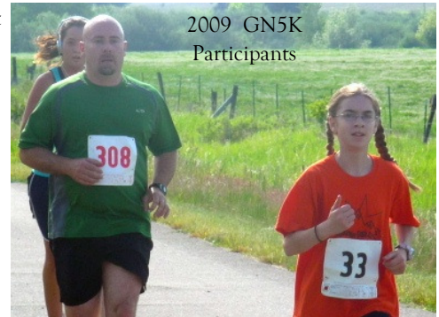
2009 GN5K Participants