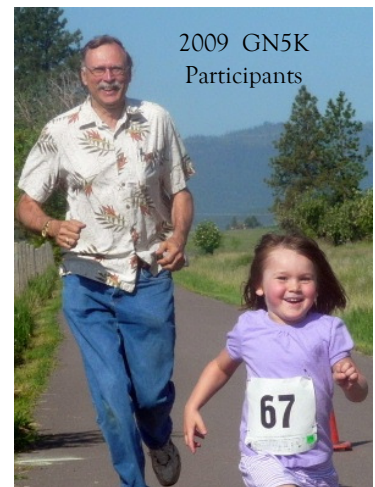
2009 GN5K Participants